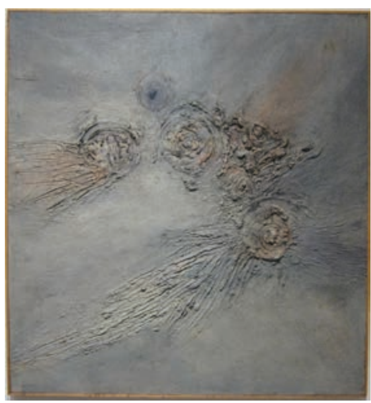
Louis Siegriest "Planets in Motion" 1966

SMC's Museum of Art (1928 Saint Mary's Road, Moraga) is open from 10 a.m. to 4 p.m. Wednesday through Sunday. Admission is free. For more information visit: www.stmarys-ca-edu/museum or call (925) 631-4379.