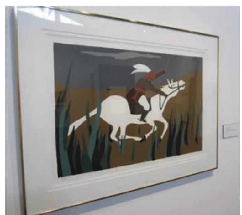
Jacob Lawrence "The Opener" 1997